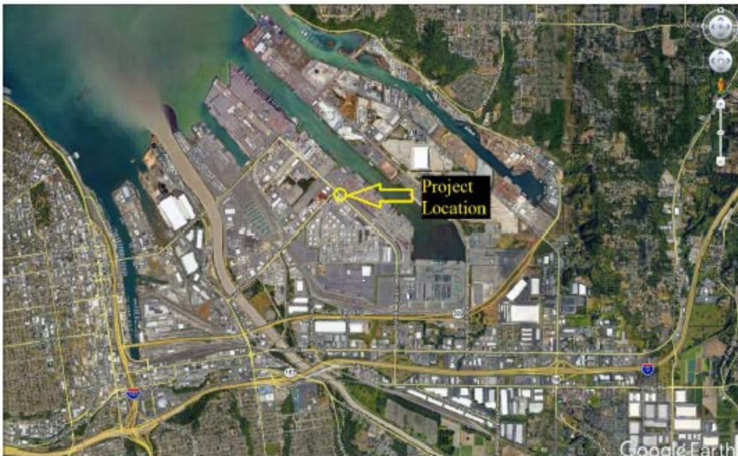
Attachment A: Detailed Vicinity Maps