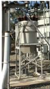
15KV Oil Circuit Breaker