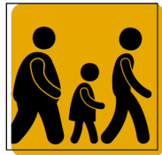
Walking tours and creative placemaking