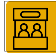
Tabling at community events