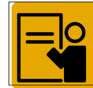
Community presentations and briefings