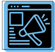
Online open house