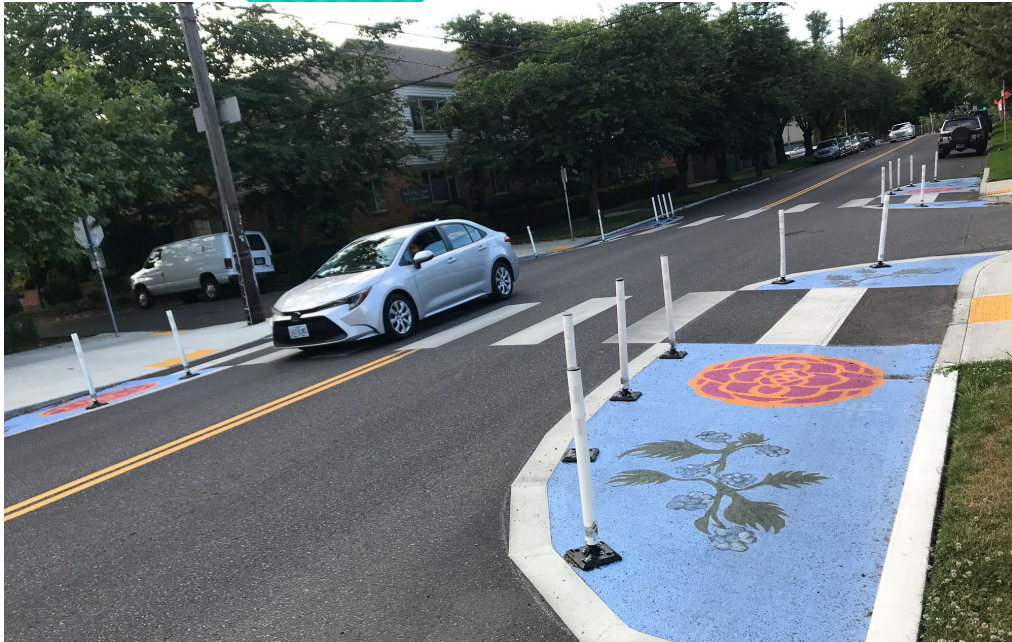
Intersection safety enhancement at East Division Ln and McKinley Ave – Temporary bulb-outs, repainted crosswalk, and painted street mural to calm traffic