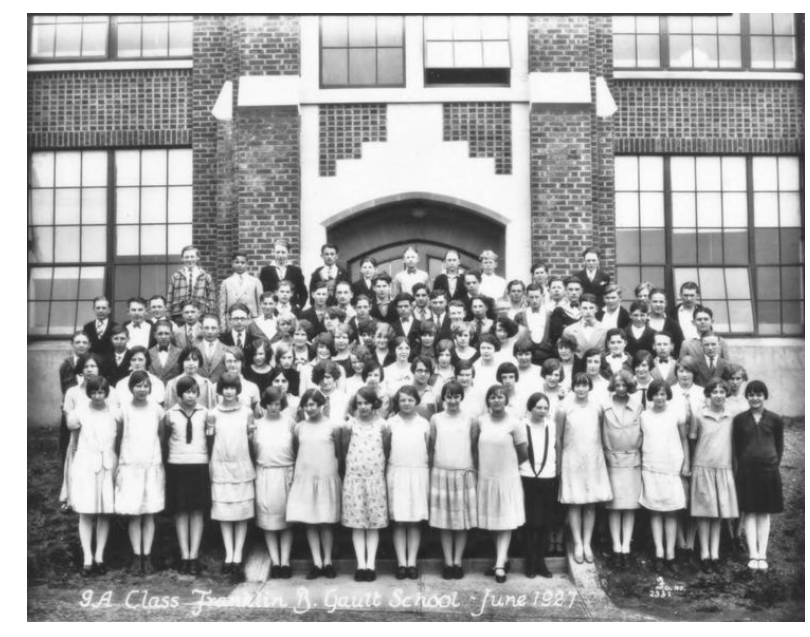
Historic photo of Gault School