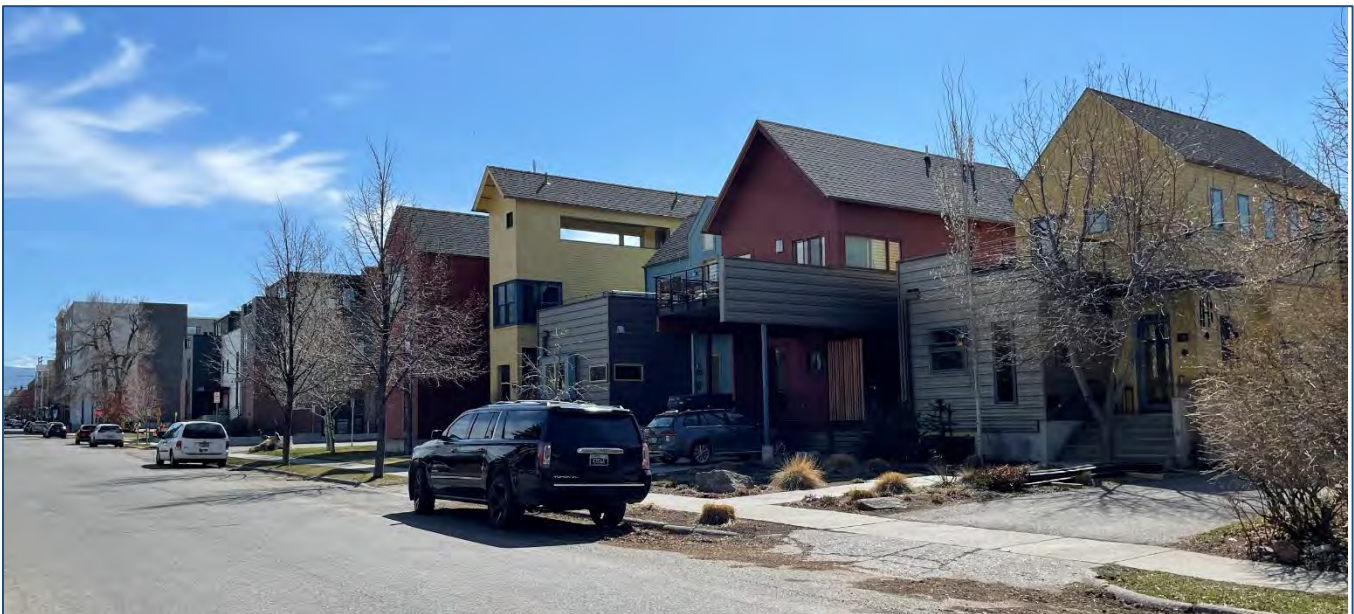
Recent infill housing providing a transition from existing houses to nearby larger buildings (Bozeman, MT)