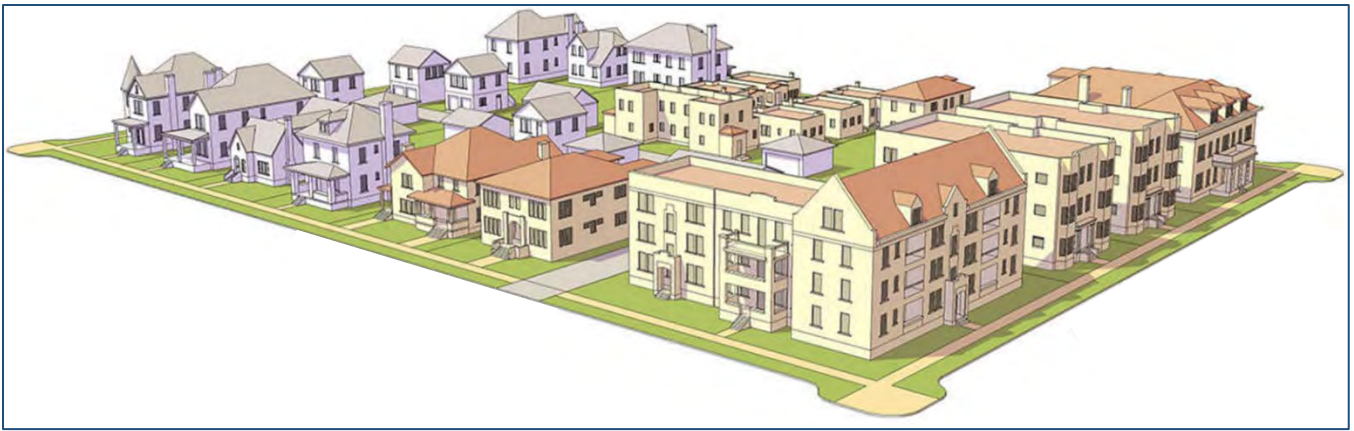
Illustration of a transition from Low-scale to Mid-scale housing, with taller structures only near dense centers