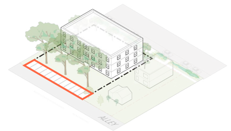
Illustrative diagram showing parking area

◀ Parking is reduced through the Reduced Parking Area Expansion - 1/2 mile walking distance from major transit stops. Includes Pac Ave, transit lines #1, 2 and future LINK extension. Applies only to residential zoning districts.