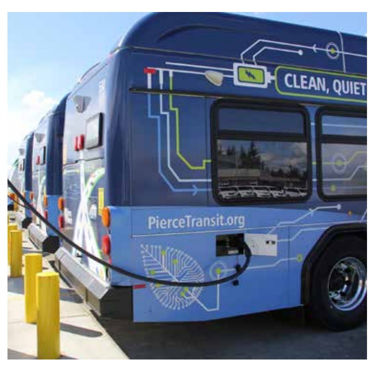
Pierce Transit now has 9 battery electric buses in its fleet, which save on fuel costs and tailpipe emissions.

Pierce County: The County has a Sustainability 2030 Plan and decarbonization goals in alignment with Washington State's target for a 45% reduction in greenhouse gas emissions.