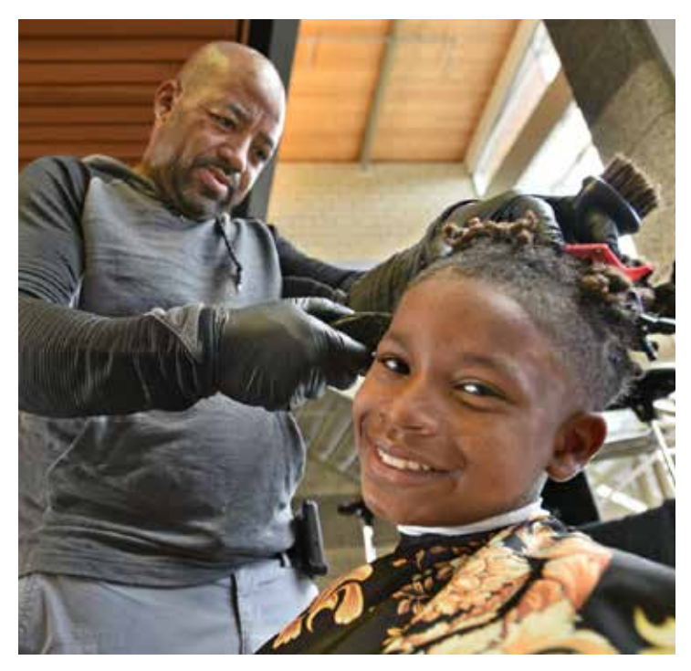
The Summer Late Nights program offered a variety of services, including back-to-school haircuts.