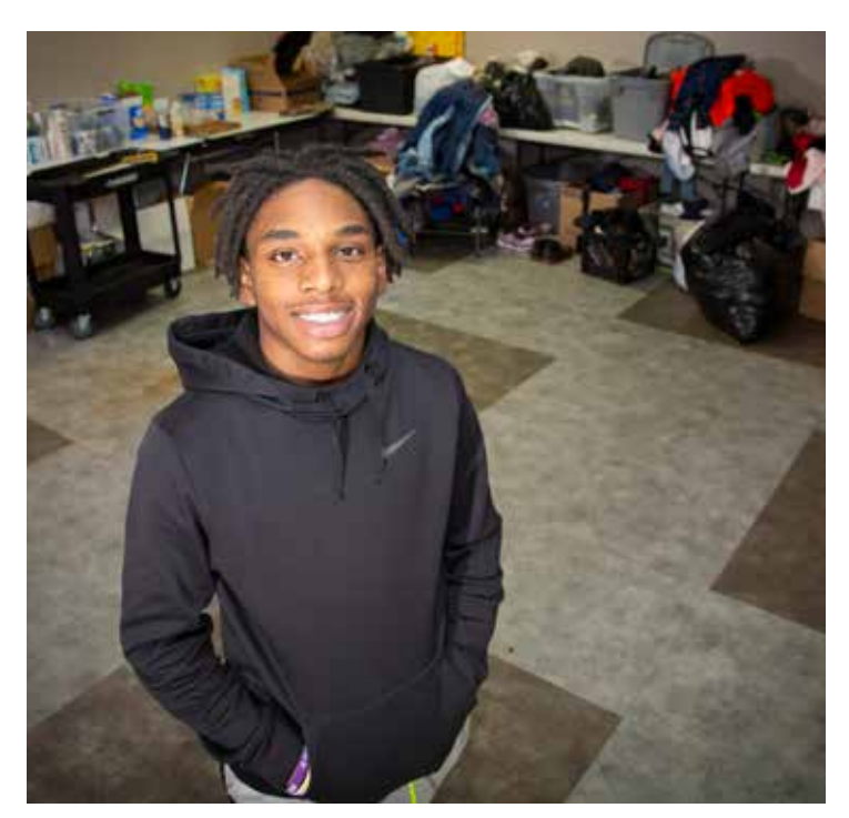
Participation by students and employers in the Jobs 253 program is growing rapidly.