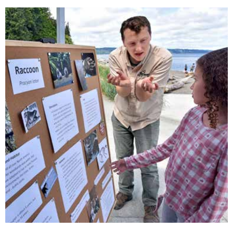
Park Guides are part of a new multi-agency alternative response model.