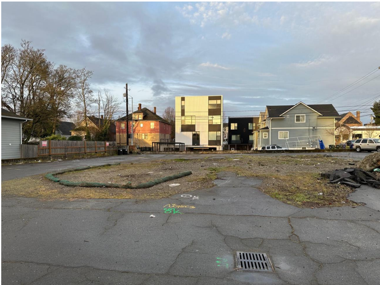
6TH AVENUE – SCALE? Design? Near Sheridan cross street.