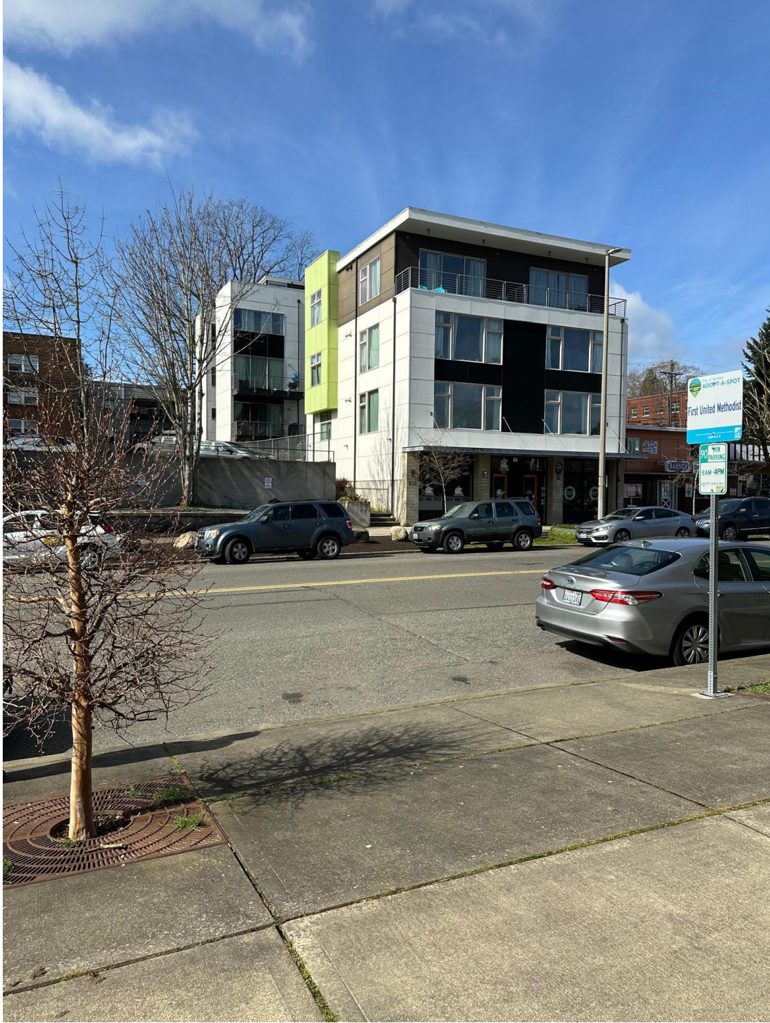
Tacoma Avenue – SCALE? This appears to be about 60 feet high. Need to check.. . .