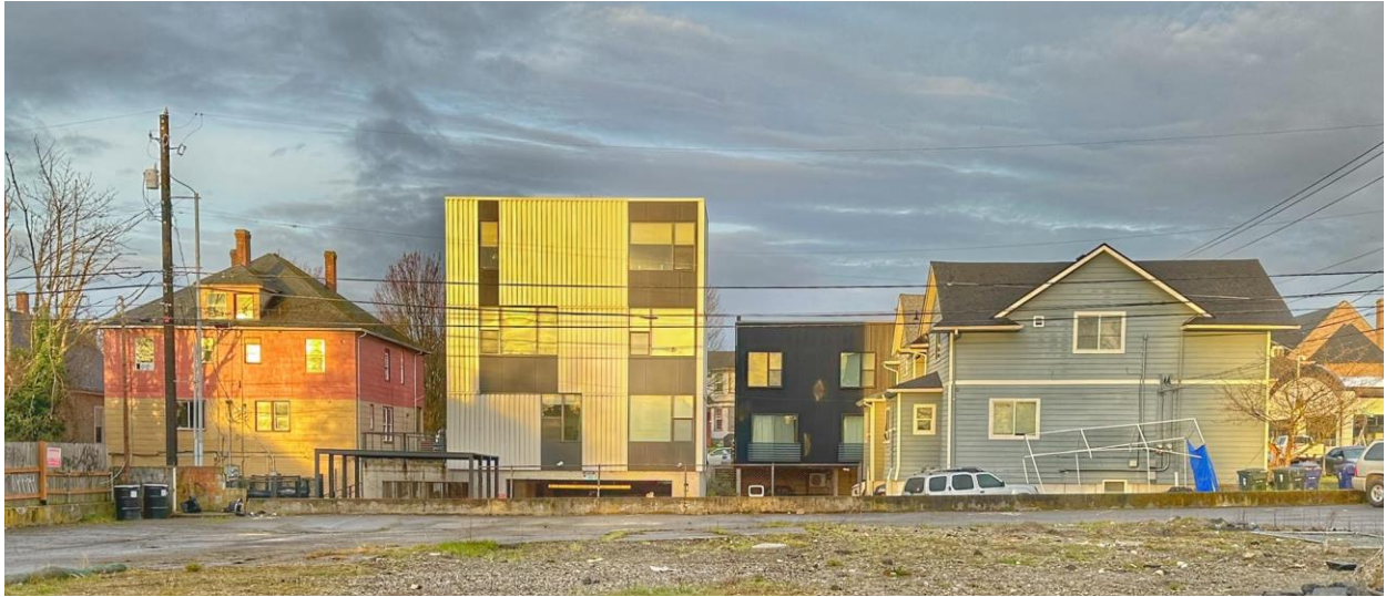
3 story infill. Very big on this block. Not to scale and not to any design. Design Review?